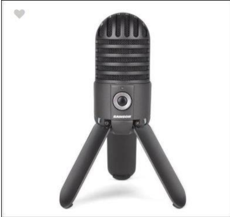
Samson Meteor Large Diaphragm USB Studio Microphone - Titanium Black

https://www.adorama.com/samtrtb.html?gclid=EAIaIQobChMI15mLg6ee1QIVBjFpCh0DrgfqEAYYBCABEgJLufD_BwE